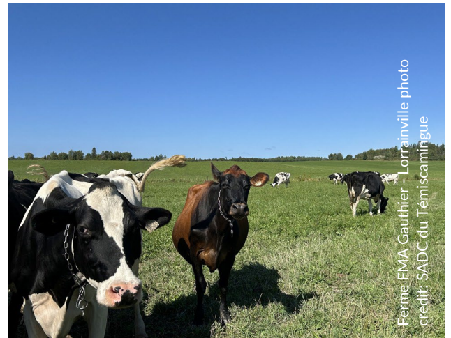
Ferme EMA Gauthier - Lorrainville

The region already has an action plan in place through the Plan de développement de la zone agricole (PDZA), which addresses several challenges in the agricultural sector. Therefore, it is important to refer to this plan for issues related to mobilization, branding, attractiveness, succession planning, market development, and more. However, to address climate change and support the growth of innovative businesses, cooperation between the academic and business sectors is essential.