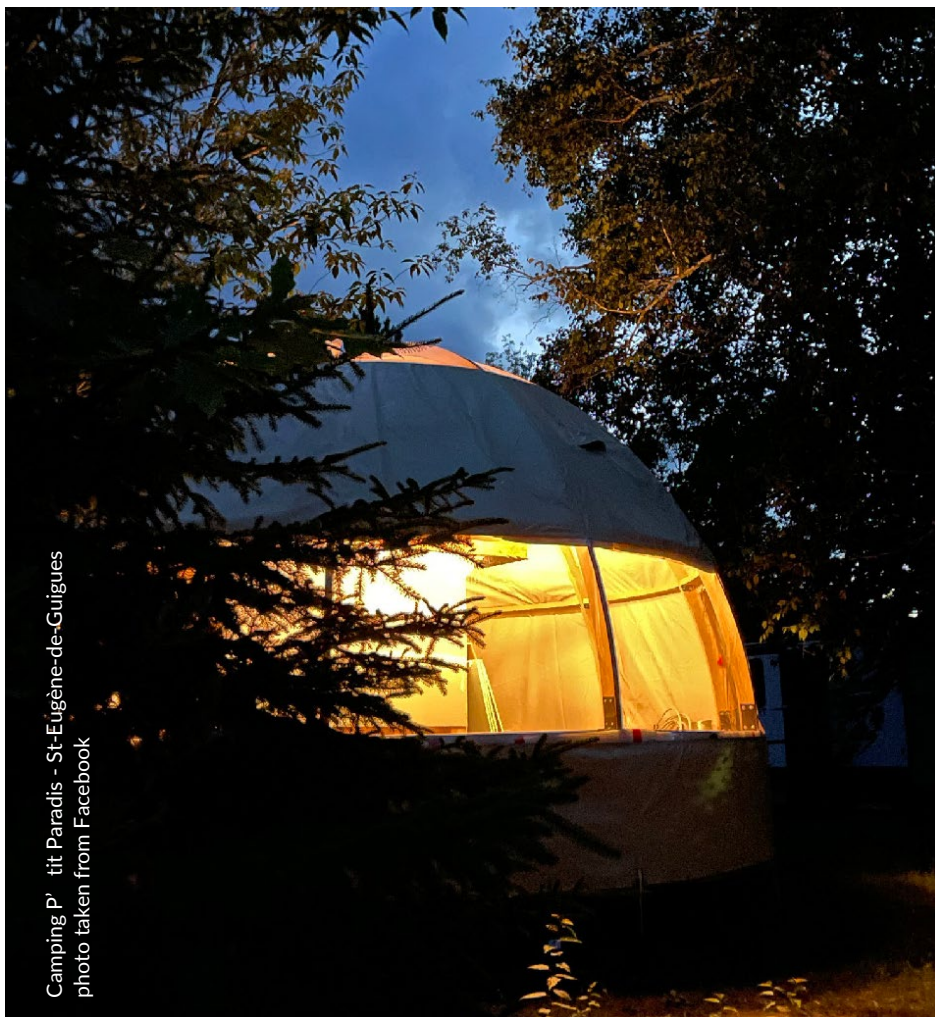
Camping P'tit Paradis - St-Eugène-de-Guigues